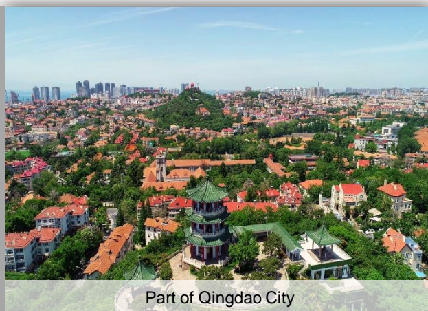
Part of Qingdao City

Qingdao, also known as island city, is a vice provincial city in Shandong Province. It has been approved by the State Council as an important coastal central city, a coastal resort and tourist city, and an international port city. By 2019, the city has jurisdiction over 7 districts and 3 county-level cities, with a total area of 11293 square kilometers. In 2019, the total permanent population of the city is 9.4998 million.