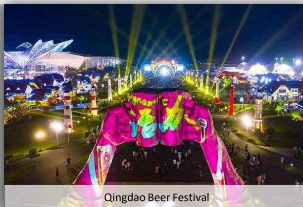
Qingdao Beer Festival

Qingdao International Beer Festival was founded in 1991. It opens on the second weekend of August every year for 16 days. It is a national large-scale festival integrating tourism, culture, sports and economy and trade. It is also a beer festival in Asia. Today, beer festival has become a grand festival to highlight the unique advantages and charm of Qingdao city. Beer is used as the medium to show the Qingdao beer company and the city. Since it was held, breweries from dozens of countries, regions and domestic have participated in the event, with more than one million tourists from all over the country.