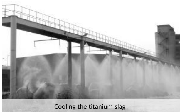
Cooling the titanium slag

Yunnan province has abundant resources of titanium resources. Its limonite with high-grade, less impurity and easy exploit. Statistics show that the yunnan province has proven 30 ilmenite deposits, with reserves of 55,610,000 tons of which high-quality ilmenite reserves up to 32, 650,000 tons. Through unremitting efforts, Yunnan has formed a relatively complete industrial chain of titanium. It already established titanium and titanium alloy ingot smelting, wide strip coil hot-rolled, cold-rolled, bar and wire rolling, forging processing with the leading domestic level titanium processing industry chain.