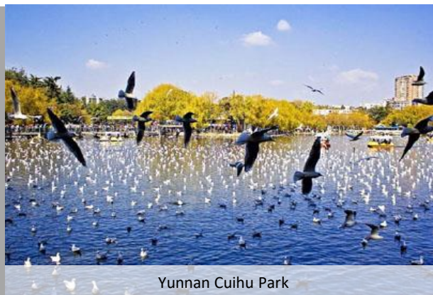
Yunnan Cuihu Park

They hover around the Dian chi lake, Cuihu lake, live in every river of Kunming.